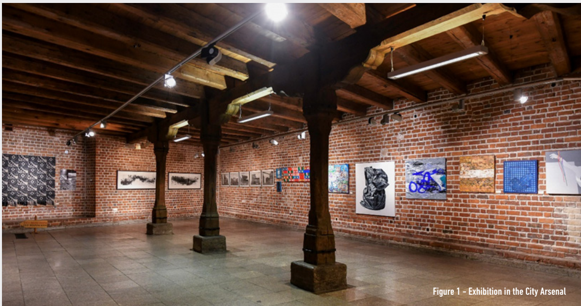
Figure 1 - Exhibition in the City Arsenal